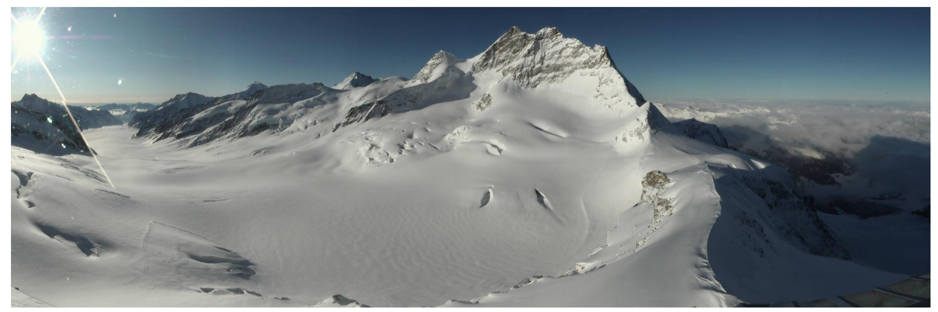
Jungfraujoch, Aletsch Glacier (largest in Europe), «Top of Europe»