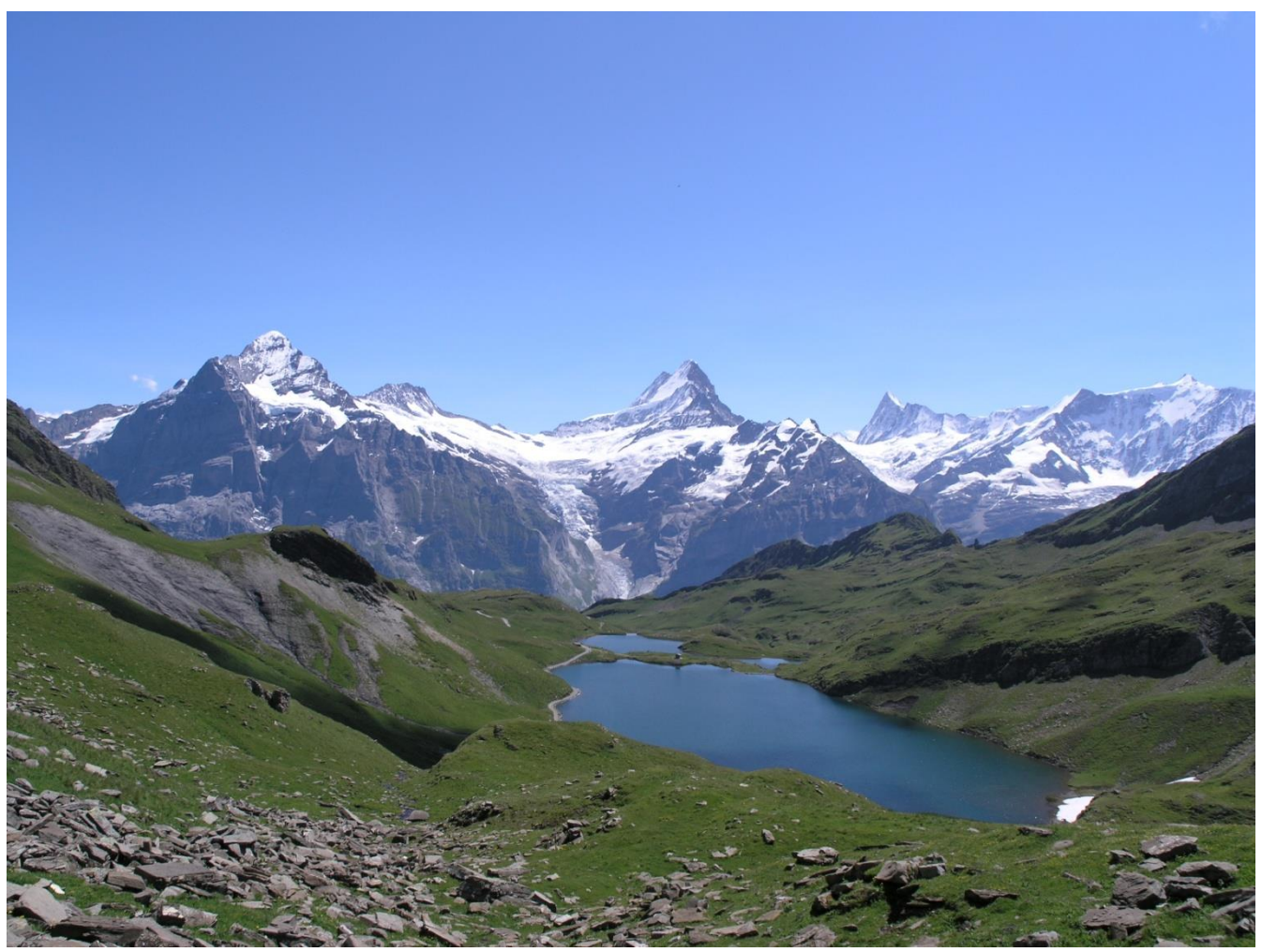
High alp near Grindelwald